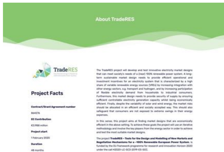
Figure 5 - About Page of TradeRES website

At the About Page it is possible to know general contractual details about the project, namely its contractual name, acronym, EC grant number and budget, start and duration, as well as the general overview of the project and the main envisaged steps.