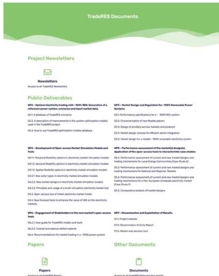
Figure 9 - Documents Page of TradeRES Website

At the Documents Page is where all the relevant publications associated to TradeRES will be available. These documents will include newsletters, papers published in the scope of the project, public deliverables, among other relevant information. It will be possible for the audience to access and download these documents in order to review the progress of this project.