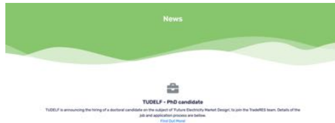
Figure 10 - TradeRES News

At News&Events Page the audience will be regularly updated with both News of the project, such as main highlights, available job positions and other, and also the Events organized by the project and events in which the project partners have participated to disseminate project results.