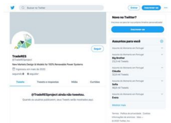
Figure 2 - TradeRES Twitter Page