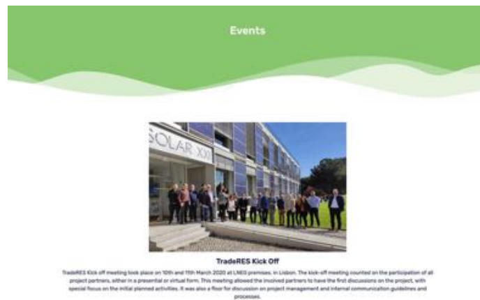
Figure 11 - TradeRES Events