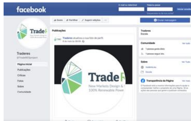
Figure 3 - TradeRES Facebook Page